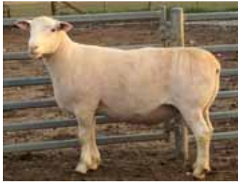
Bundara Downs 168133

Bwt: 0.41 Wwt: 10.57 Pwwt: 17.13 Pfat: -0.27 Pemd: 2.36 Lamb 2020: 212.59 Carcass +: 115.12