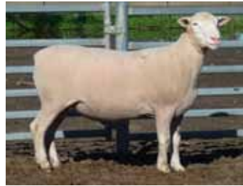
Bundara Downs 168357

Bwt: 0.41 Wwt: 10.57 Pwwt: 17.13 Pfat: -0.27 Pemd: 2.36 Lamb 2020: 212.59 Carcass +: 115.12